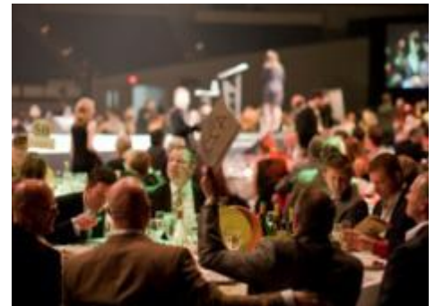
Table Host ($2,500) Unlimited opportunities are available at this level. Each table seats ten guests and all table hosts committed prior to March 1 st are listed in the Art Catalog.

Docent Sponsor ($5,000) There is no limit to this level of sponsor. Benefits include: sponsor's name in all press releases; name included in the invitation; prominent placement of sponsor logo/name on website homepage; acknowledgement from the main stage; plus one table at the Patron Event to host 10 guests for the evening.